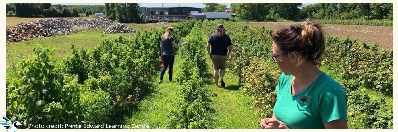
Learn more at thecountyfoundation.ca

Food literacy session through Prince Edward Learning Centre