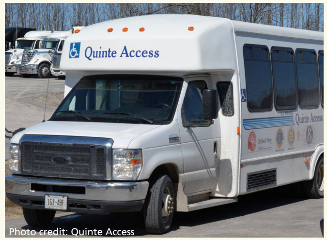
Quinte Access Bus

A fixed and flexible transit system is what can and will connect our County.