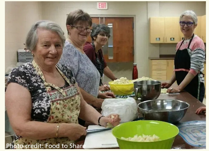
Food to Share cooking session

Collective actions to improve food security are what connect us today and tomorrow.