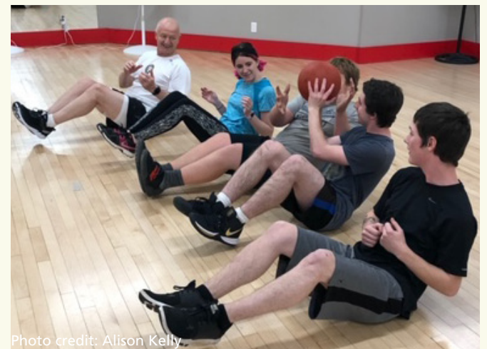
Youth Inclusion Program members participate weekly in Movement Tuesdays at Prince Edward Fitness & Aquatic Centre

A total of $78,000 of provincial and private funding was directed to youth and youth-led activities. Collective members, volunteers and supporters collaborated to ensure that funding connected projects to County youth.