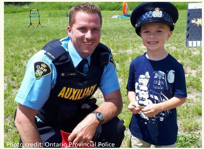
OPP Prince Edward County